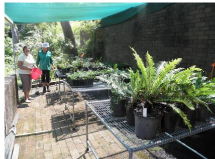
New benches in the fern area