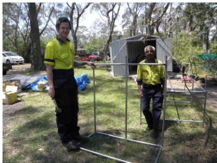
Putting the new benches together